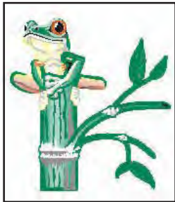
.gif @ 400%

AVOIDING ADDITIONAL COSTS Files obtained from the Internet (.jpg or .gif) or artwork created in MS Office applications (Word, PowerPoint, Publisher, Excel, etc.) are not suitable for high quality output, and require additional hourly charges. Artwork should be created in a design program at 50-100% of actual size. If you have very large files please contact us for options. To avoid additional costs, please send files using the guidelines below.